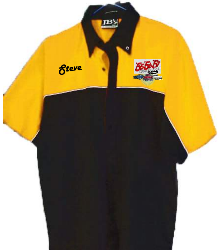
Bowling style shirts Mens Shirt $45.00